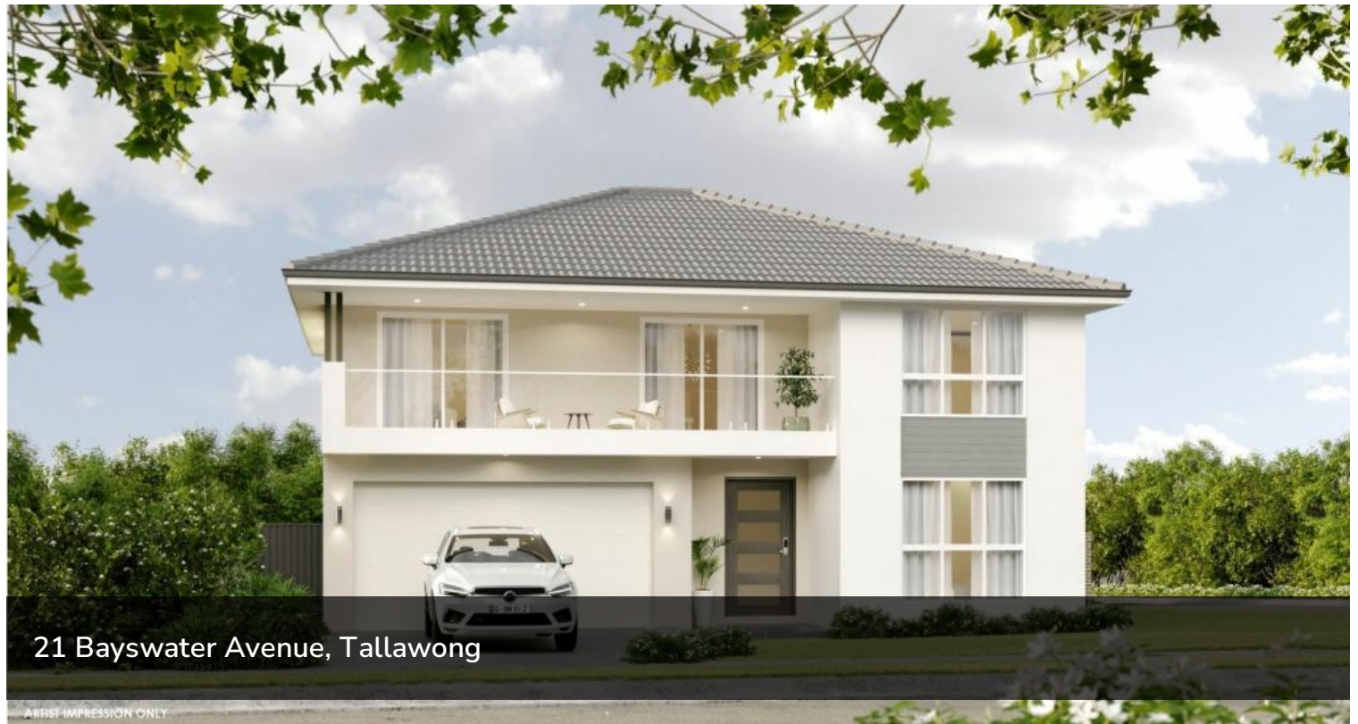
21 Bayswater Avenue, Tallawong