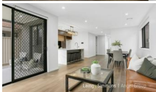
Laing - Simmons | Angel Group