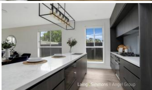
Laing - Simmons | Angel Group