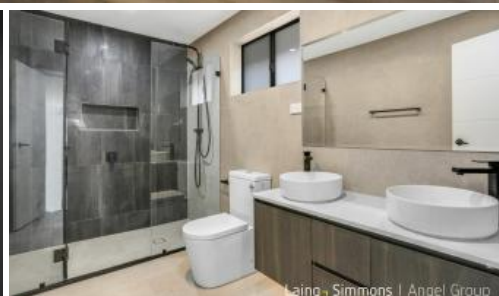
Laing - Simmons | Angel Group