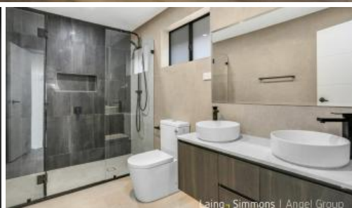
Laing - Simmons | Angel Group