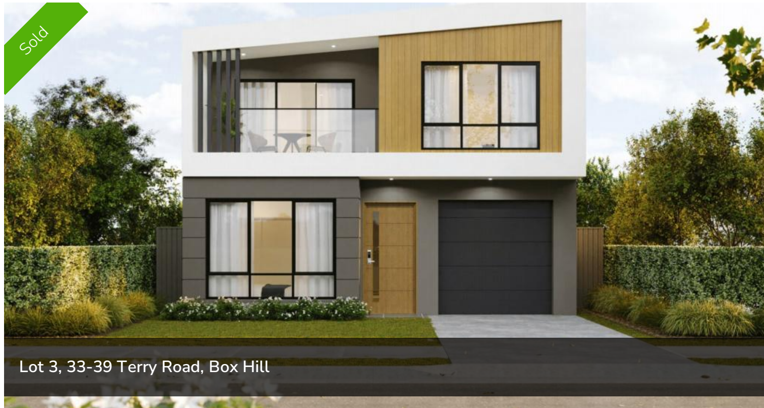
Lot 3, 33-39 Terry Road, Box Hill